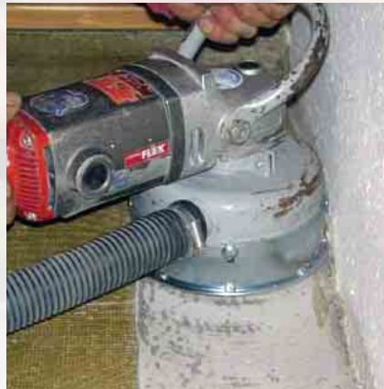
Abrading edges and small surfaces