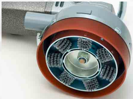
HSF 150 with cutters solid tungsten carbide WCT and vulcollan sealing ring.

The low-vibration HSF 150 is a must for any renovation work and sub-flooring preparation. It is indispensable when working on small or inaccessible areas and for edge and corner work. The new support ring for adjusting the cutting depth must be employed when using the PCD cutting tools. It functions also as a dust protection ring. When used together with other tools the abrasion-resistant Vulkollan ring seals the dust extraction hood. When used in conjunction with an industrial dust extractor operation of the HSF 150 is almost dust-free.